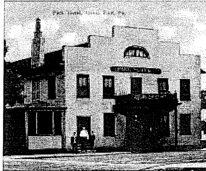
Park Hotel a.k.a. "The Brawley House"